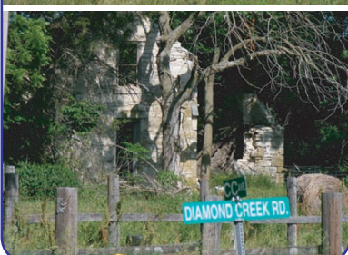
above images, 2009 Stampede